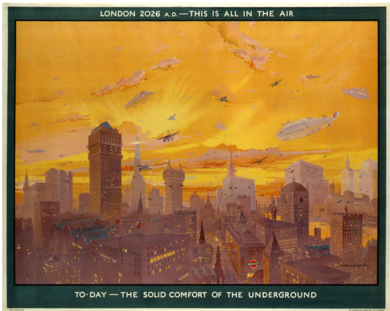
The solid comfort of the underground, by Montague Black, 1926