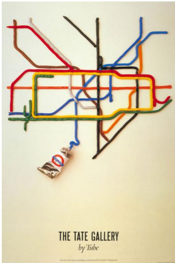
The Tate Gallery by Tube, by David Booth, 1987 (best-selling Underground poster of all time)

The forms in which we collectively imagine social life are often reflected in, and in turn inform graphic material used for propaganda and marketing purposes. A retrospective exhibition of posters on the London Underground offered an opportunity to reflect on the shifting ways in which the changing nature of London and its transport have been conceived of.