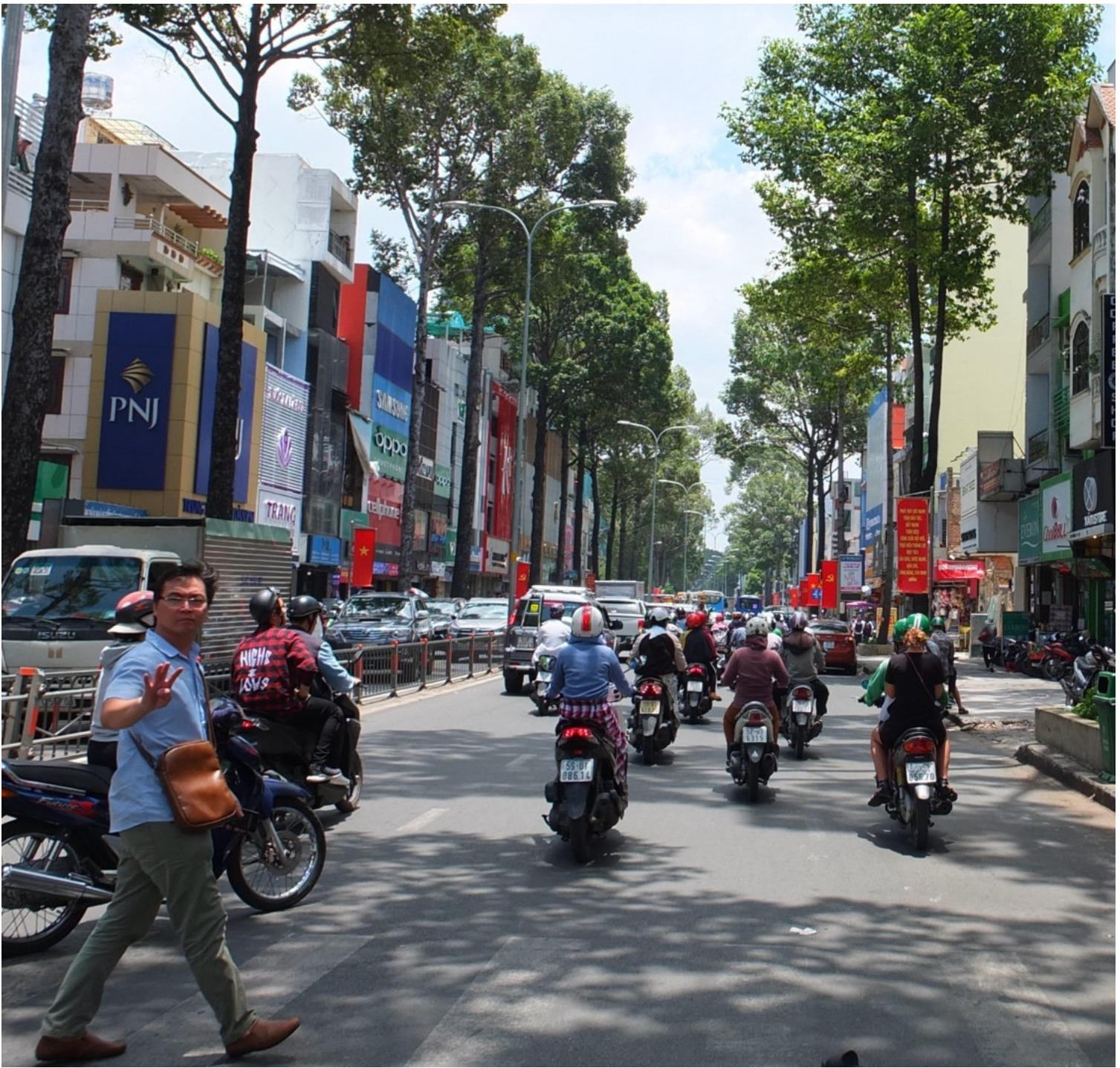
Figure 2 – A typical boulevard of Ho Chi Minh City (photo credit: author, 2018)

And “this is not what the modern city looks like,” according to a transportation planning professor who regularly consults for the local government. For him, the “modern city” is Singapore, Seoul, Moscow, Tokyo – cities he visited to learn from their “best practices,” where motorbike mobility is virtually non-existent and street life much more regulated.