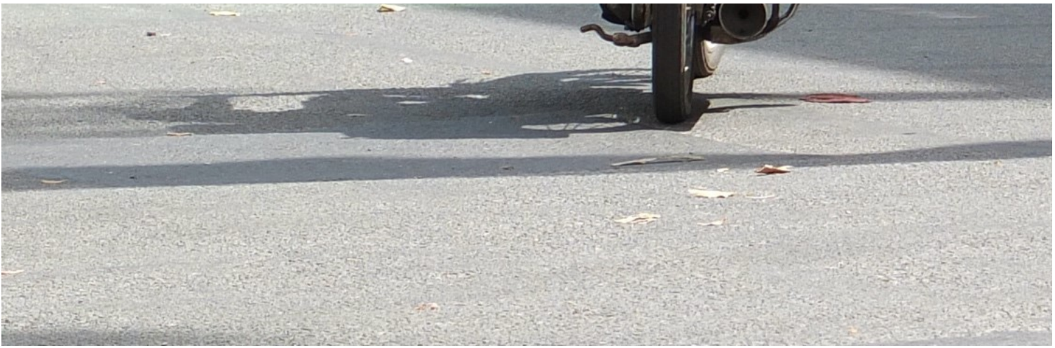
Figure 5 – Back from school on the back of a motorbike

The process indeed works to the advantage of the upper-middle classes, and at the expense of the quality of life of the others. Each car that is added to the traffic of Ho Chi Minh City impedes a little more the mobility of the majority, that is motorbike riders. The increased comfort and safety enjoyed by a minority of car users comes at the expense of the road safety of the majority. Ngọc, a wealthy entrepreneur who only travels by car (with a driver), is aware of this inequality. As she puts it: "In an accident involving a car and a motorbike, most of the time someone dies; and it rarely is the person in the car."