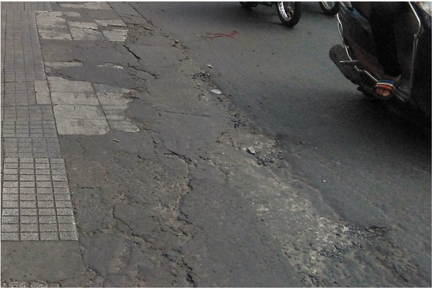
Figure 4 – A busy street at peak hour between jammed cars, buses, trucks, and motorbikes

Generally supportive, reactions to the ban can be classified into three categories depending on people's adaptability.