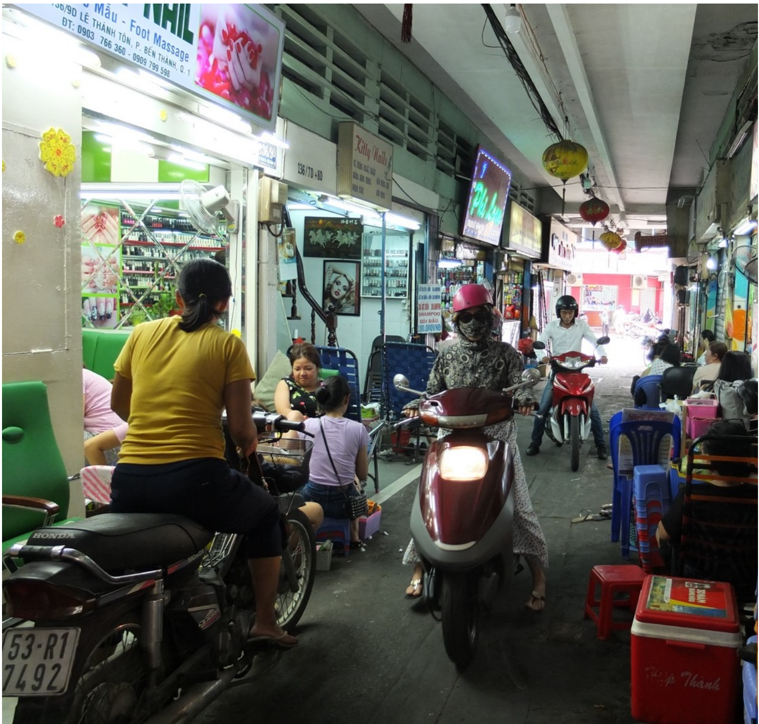
Figure 3 – Motorbikes in the interstices of urban life