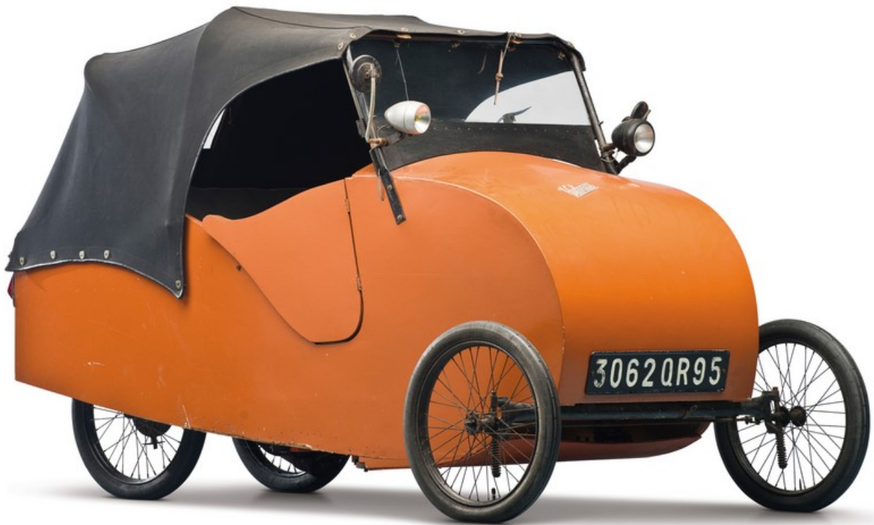
Velomobile type H

electric) and over their entire lifespan thanks to local production and greater reparability. These vehicles provide greater flexibility than bicycles (balance, speed, effort, transport of goods and people, etc.) and are more adapted to local trips than cars as we know them today. They are particularly suitable for local daily trips: going to work, shopping, transporting equipment, accompanying children and the elderly, etc. As of today, they could meet the needs of 30% of the population whose daily activities fall within a 9 km radius of their homes, of 60% of the working population with a commute under 9 km, of 23% of workers making daily or occasional business trips, or even of families with 2 or 3 children. There are also vehicles adapted for people with reduced mobility, for example low step through bicycles, vehicles with hand pedals or even those with a platform to accommodate a wheelchair.