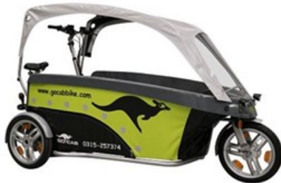
Gocab – bicycle taxi for 8 children

These vehicles could be easily produced and repaired thanks to a decentralised system that would combine both industrial manufacturing (for components) and craftsmanship (for assembly and repair). These vehicles could thereby be produced locally, in small factories throughout the territory, which would create jobs and improve the working conditions of manual workers.