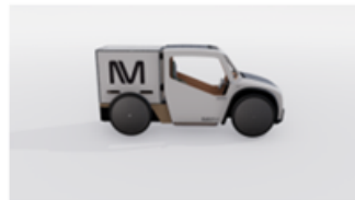
Bike-car commercialisé par Midipile