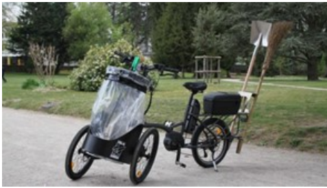
Three-wheeled cargo bike by Kiffy, which has a trailer hitch ©Kiffy