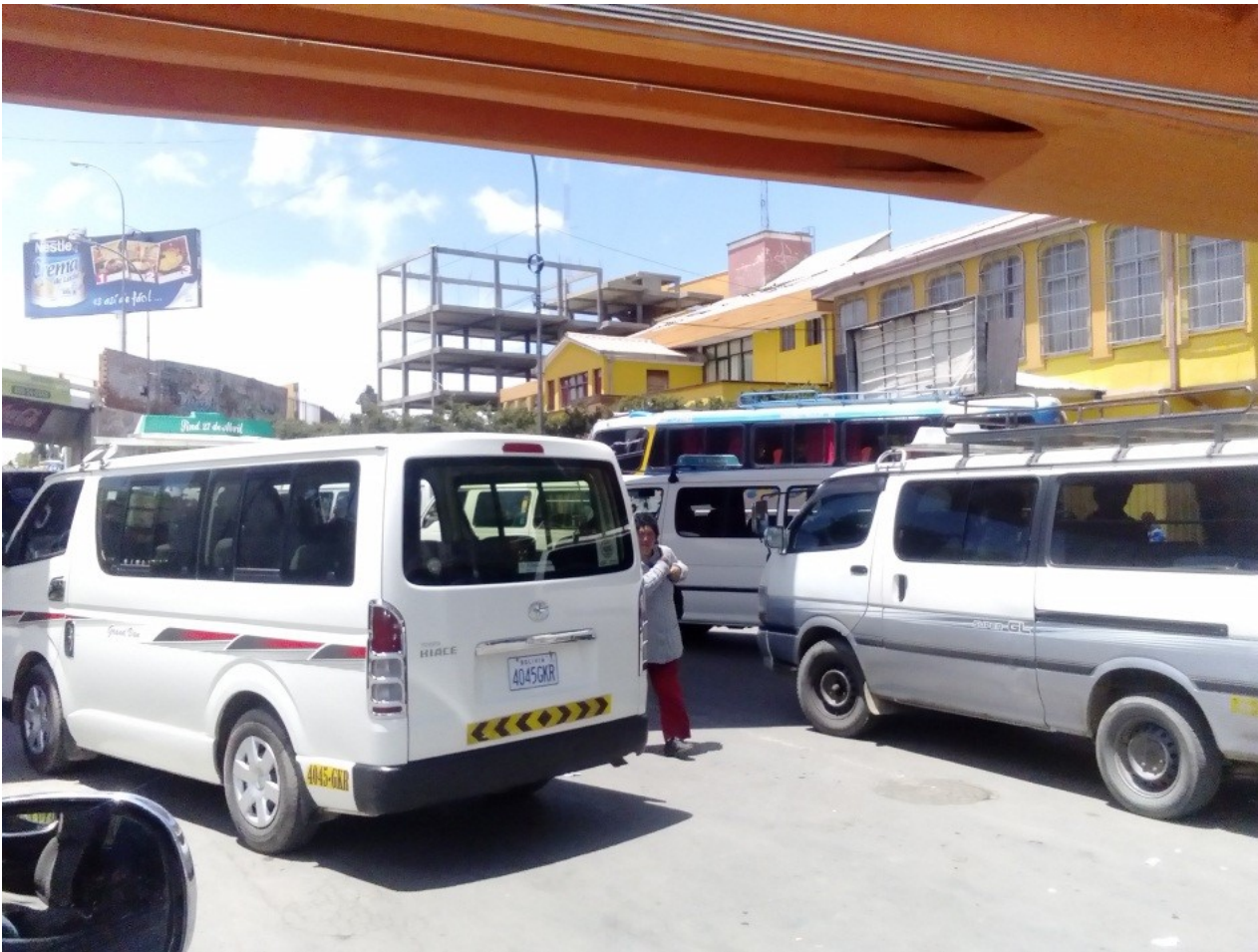
An example of vehicle chaos in La Paz