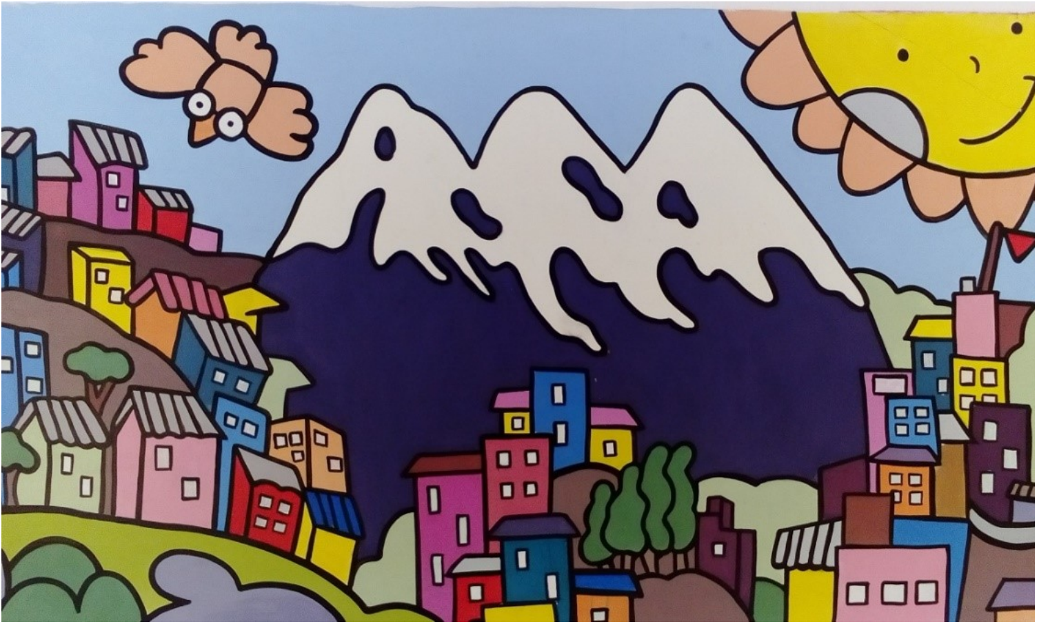
An iconic representation of the city of La Paz. Pipiripi Museum, La Paz.