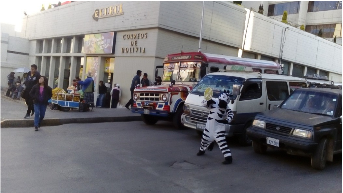
A Zebra in the city center