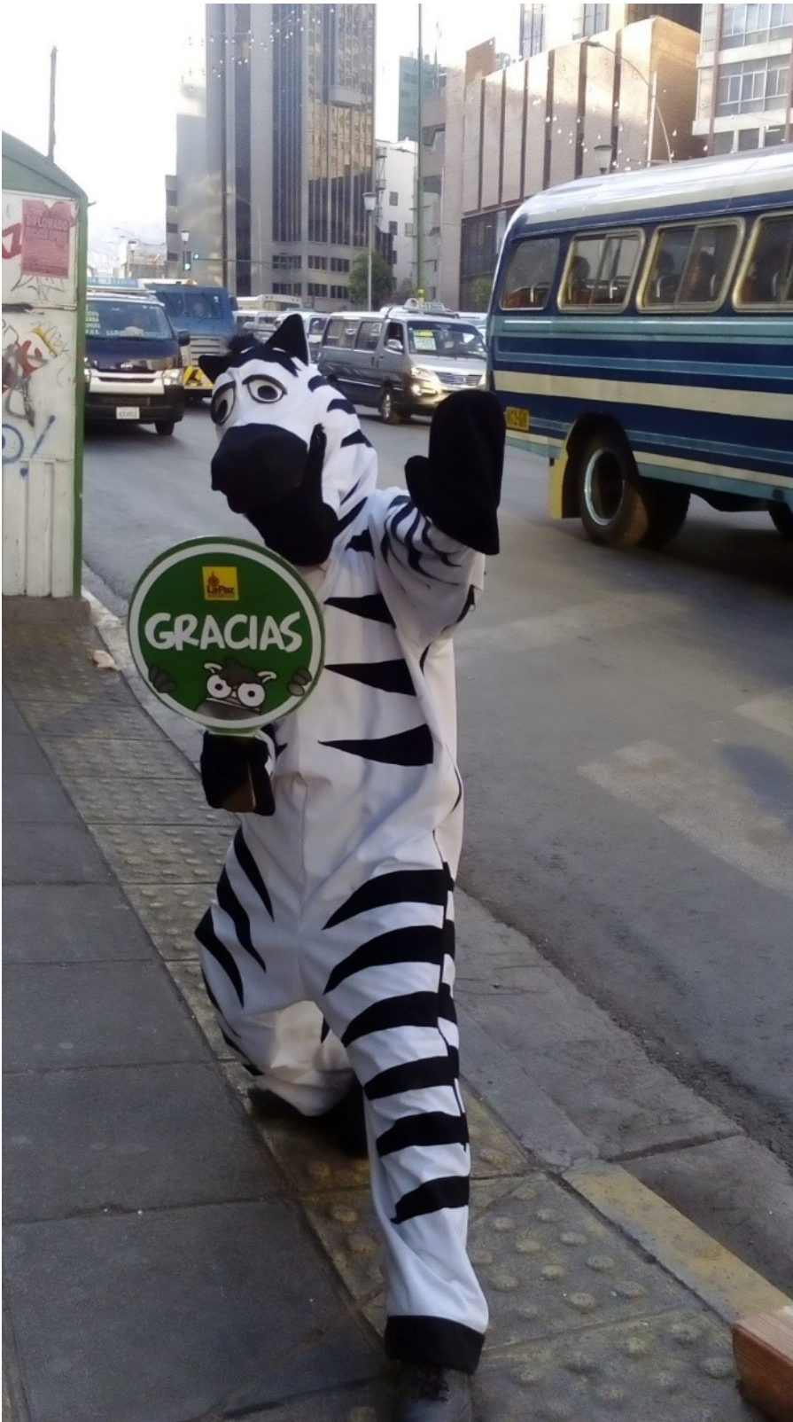
"Thank you!" The words that echo a friendly urban attitude