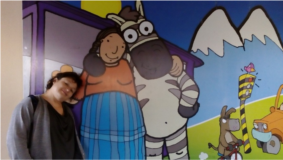
Las Cebras are an icon of conviviality for La Paz