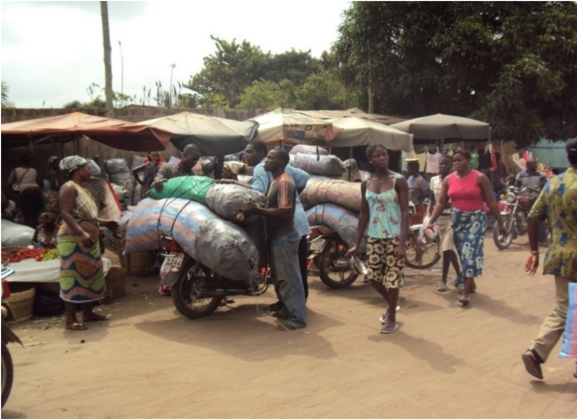
Drivers and customers negotiate for the transport of bags of charcoal in a market in outside of Lomé.

The motorcycle taxi world is also a world of rivalry and protest against the public authorities (police, tax services, town hall, etc.). Failure to comply with regulations (driving without a license, refusal to wear a helmet, non-respect of traffic laws and lights, not having an inspection sticker, overloading, refusal to pay operating taxes, etc.) results in sanctions and the risk of confrontation with tax service agents, who are responsible for collecting operating revenues from motorcycle taxis and thus feared, and police officers. When tax agents are accompanied by law enforcement officials, drivers may be bullied or, worse, have their vehicle confiscated. The latter are immobilized on the roadside or at pedestrian crossings, thus obstructing circulation. Once confiscated, owners must pay all of the back taxes due starting from the motorcycle's purchase, as well as pay the cost of the pound, which can be as much as the equivalent of 10 days earnings, in order to retrieve their vehicle. Tax collectors and drivers thus play a game of cat and mouse in the urban space; to avoid arrests, illegal drivers skillfully trick the police by violating traffic laws and signals during high-speed chases, which sometimes end in serious accidents.