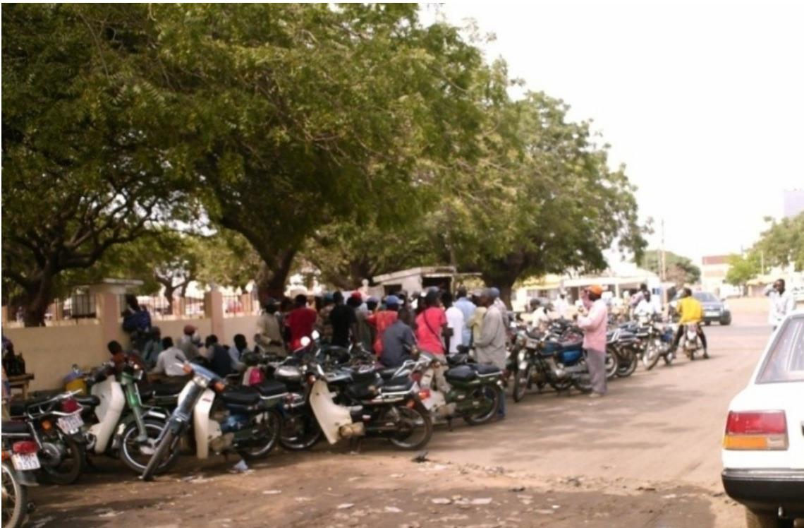
An area for rest and debate near a newspaper stand

Motorcycle taxis also seem to be the source of the emergence of a "metaphorical public space" (Habermas, op cit, Fleury, op cit.) for discussion and public debate. As their work takes them to all areas of the city and allows them to encounter many people, motorcycle taxi drivers are excellent vectors of information. It is for this reason that they are often approached by political parties, associations, NGOs, marketing services and international institutions to participate in processions, campaigns and promotional activities for public, semi-public and private companies as traveling billboards