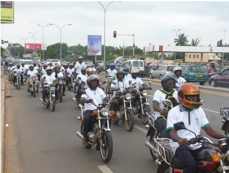
A procession for the Ministry of Agriculture, Livestock and Water, marking the World Food Day, October 22, 2016.