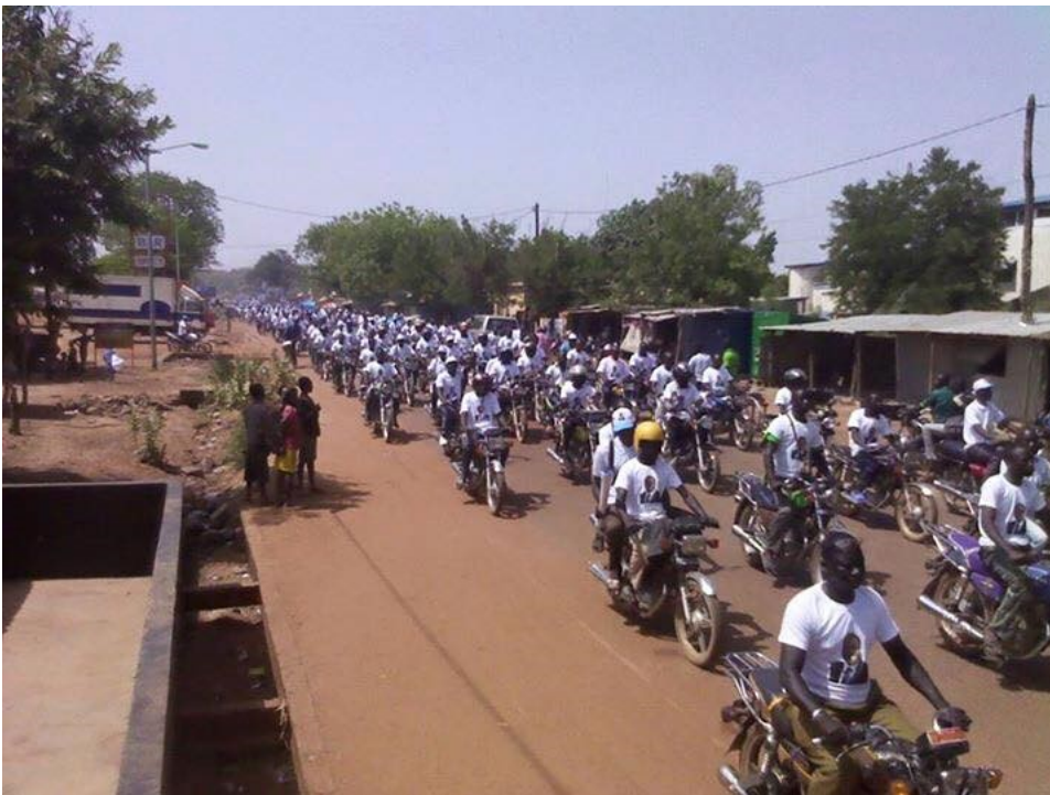
Opposition support (ANC) motorcycle taxi drivers occupy the streets during the 2015 election campaign in Lomé.

Motorcycle taxi parking areas are also centers of diffusion for news and information. Discussions with customers during the trips help spread news throughout the city. Extremely talkative and proud of their role as primary informers, drivers often discuss socio-economic and political issues with their customers. After radio, television and print news, motorcycle taxi drivers are considered the country's fourth most important source of information and rumor transmission 5 . Drivers are fond of the written press, which explains their regular gatherings around newsstands, where they often socialize. When information reaches a driver's ears it is immediately relayed and propagated.