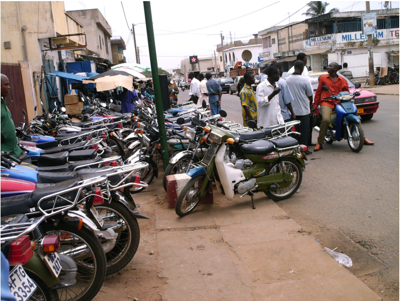
Motorcycle taxis immobilized for non-payment by the tax department at an intersection.