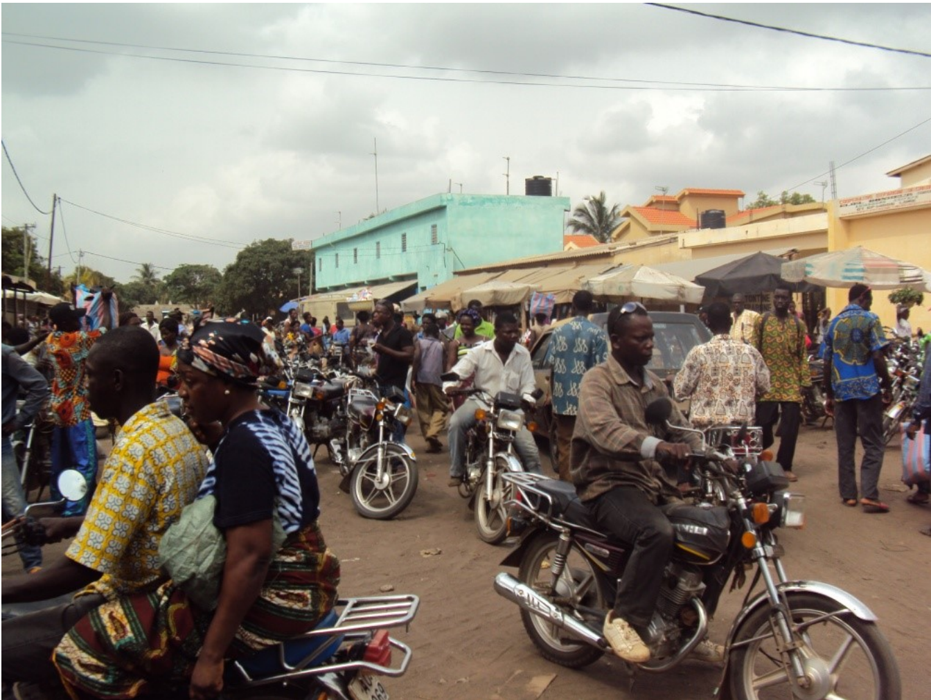
Agoè Assi yéyé peri-urban market in Lomé

Drivers are typically aged 18-60. Motorcycle taxis can operate one of three ways: