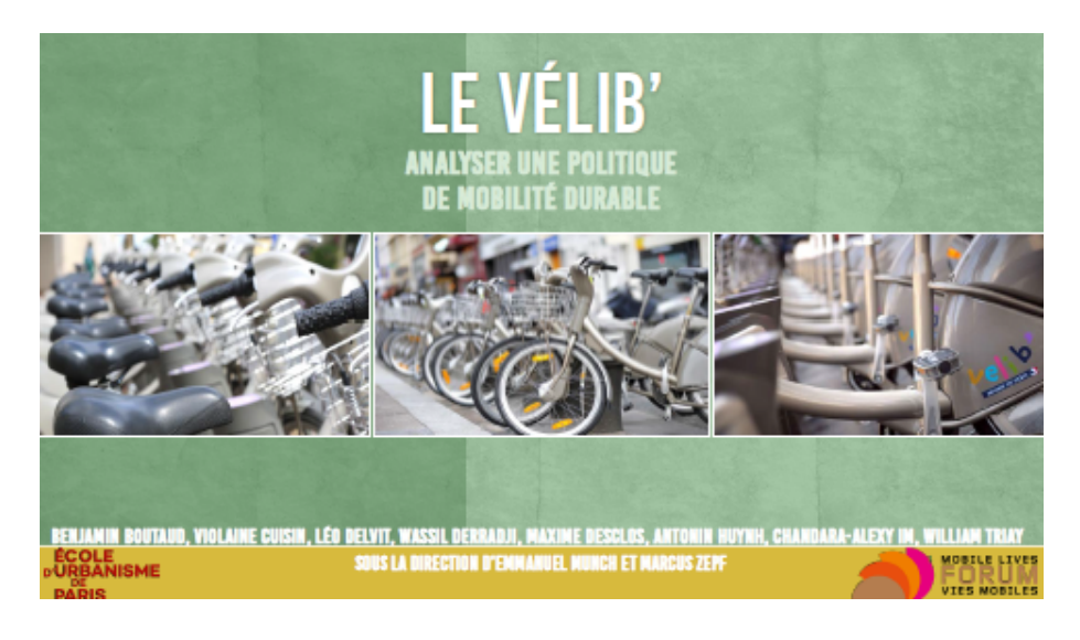
Rapport - Vélib', politique de mobilité durable ?

Power Point - Vélib', politique de mobilité durable ?