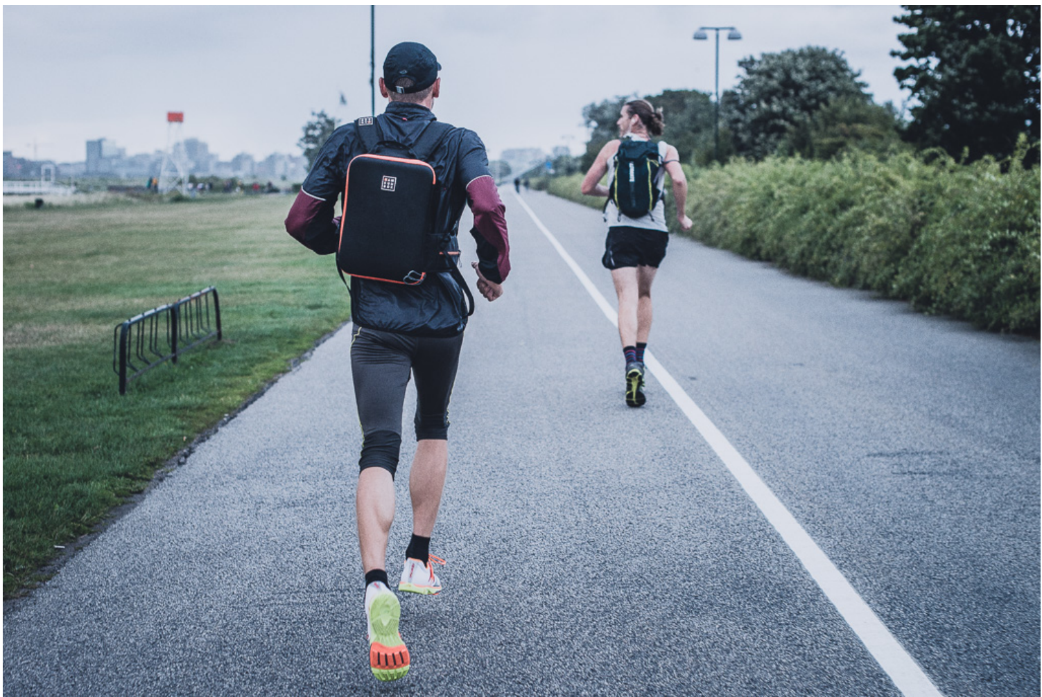
Run-commuters need to find their space in the commuting landscape.