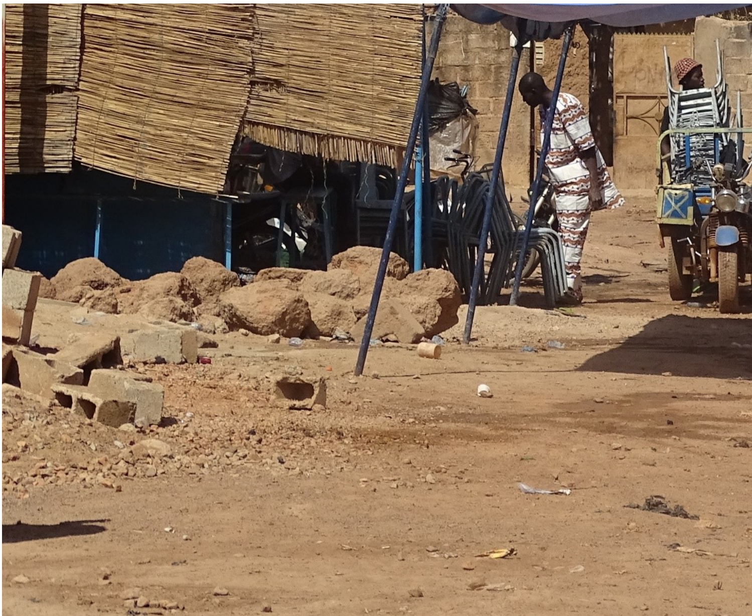
A tent spanning a road