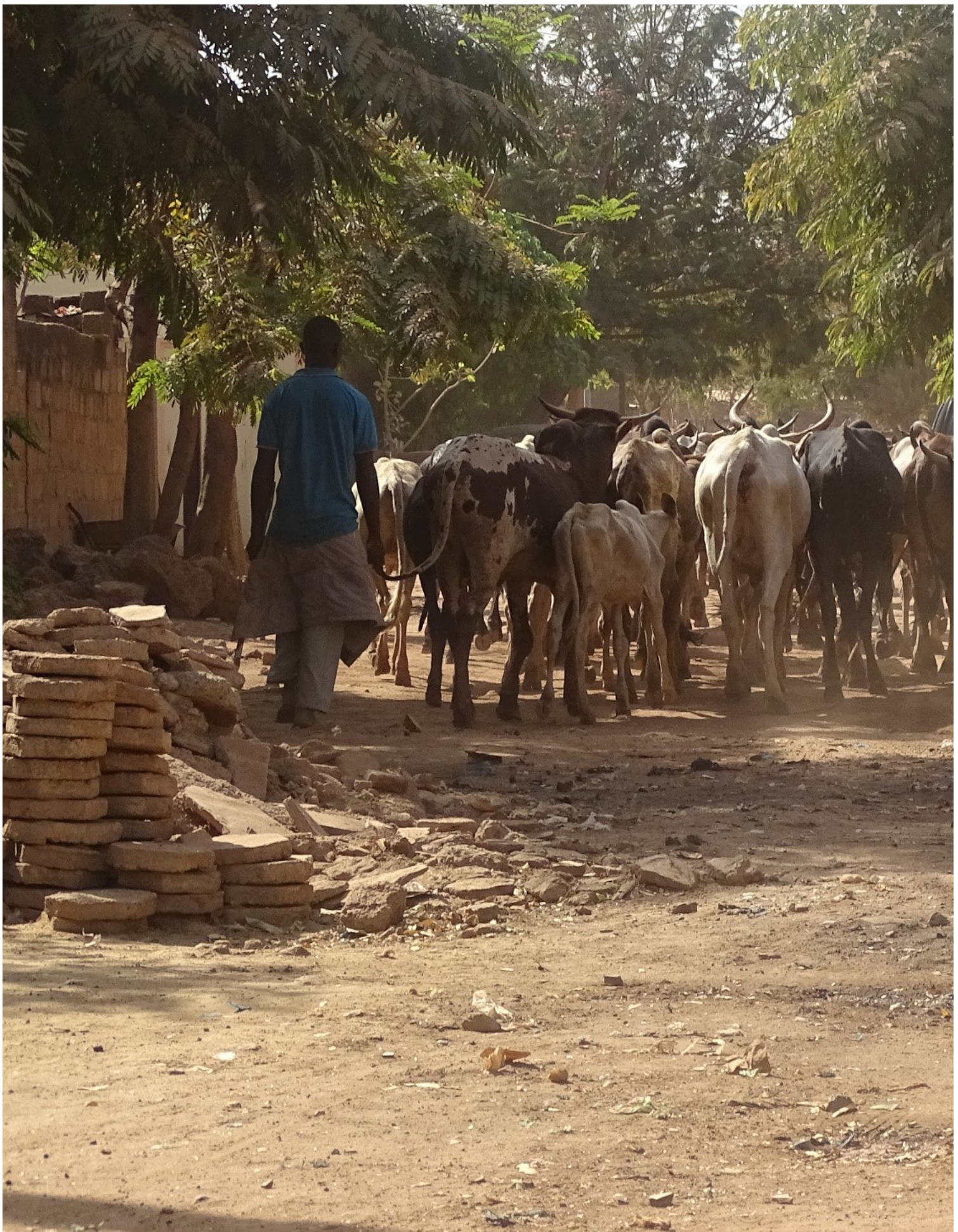
A herd of oxen crossing on a road