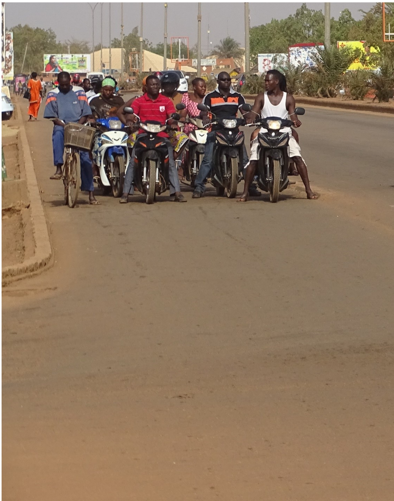
Segregated traffic on Avenue Charles de Gaulle